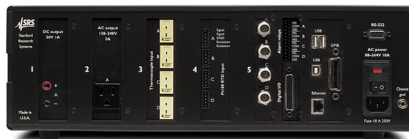
PTC10 rear panel

Macros are a powerful tool that can be used to tailor the behavior of the PTC10 for your experiment. For example, infinite-loop macros running as background tasks can take steps to address alarm conditions, automatically switch between sensor inputs (or heater outputs) depending on the current temperature or other factors, or implement cascade feedback schemes.