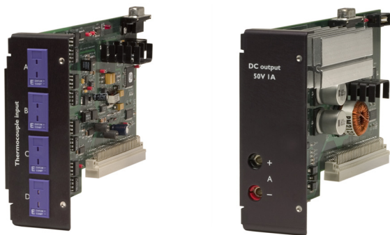
PTC330 Thermocouple Card PTC430 DC Output Card

isothermal block, with its own RTD temperature sensor, provides highly accurate cold junction measurements.